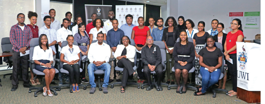
Open and CSEC Scholars at St. Augustine

At the national level, members of the QAU were heavily engaged in promoting academic quality in partner Tertiary Level Institutions (TLIs). Quality evaluations were conducted across TLIs in the Eastern Caribbean — St.