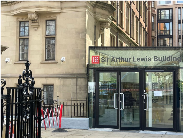
The Sir Arthur Lewis Building at the London School of Economics

The London School of Economics (LSE) has officially