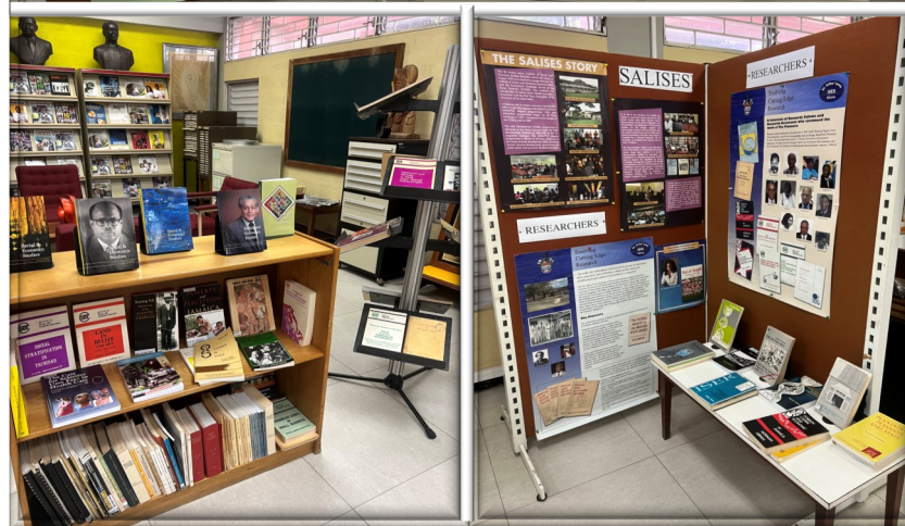
ISER/SALISES Publications for 75 Years