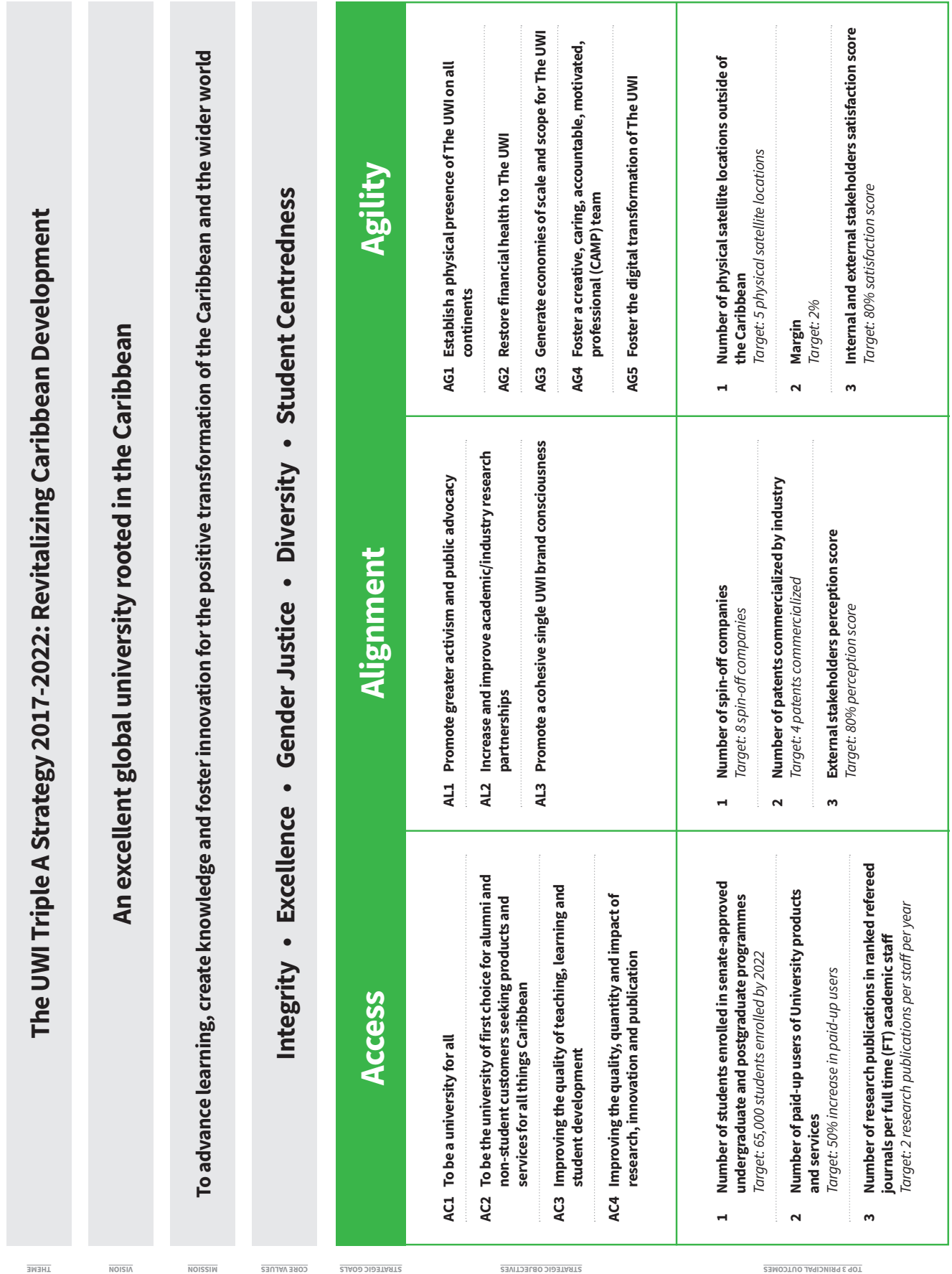
Figure 1: The UWI Triple A Strategy Framework