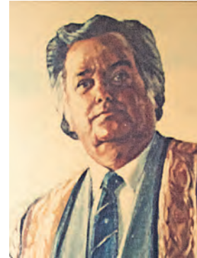
SIR SHRIDATH RAMPHAL (1989-2003)