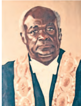
SIR HUGH WOODING (1971-1974)