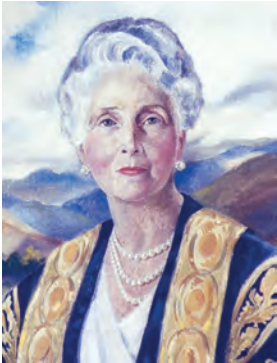
HER ROYAL HIGHNESS PRINCESS ALICE COUNTESS OF ATHLONE (1948-1971)